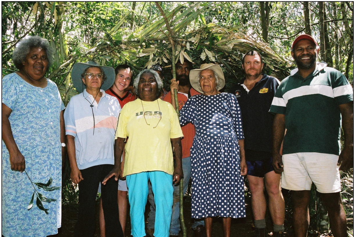
Figure 24: Ngadjon-Jii people and the Midja they built in the Malanda Conservation Park, 2002.

In late 2002, Ngadjon-Jii people built a midja in the Malanda Conservation Park (Figure 24). Constructed of various species of palm fronds, the pliable trunks of several rainforest saplings, ginger leaves and bladey grass collected from Wooroonooran National Park, the erection of the midja was ostensibly part of a larger research project investigating the architectural form of traditional rainforest dwellings. It was soon apparent, however, that the building of the midja was more than just a demonstration for scientific purposes. As Ngadjon-Jii people wove the palm fronds ( djungganyu and bibiya ) into the shell-like infrastructure of bound ( barrga ) and staked saplings ( djungganyu ), they talked about the many years spent living in midja in the buyu (rainforest) on the edge of the Malanda township.