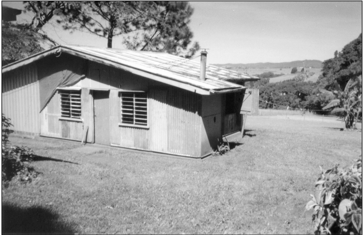
Figure 26: The Aboriginal Settlement in Malanda, ca. mid 1990s (Photo: Yvonne Canendo).

Department of Aboriginal and Islander Affairs erected a number of dwellings on the block and were basically responsible for its administration. Similar encampments were established by the Department in the Tableland towns of Ravenshoe and Mt Garnet.