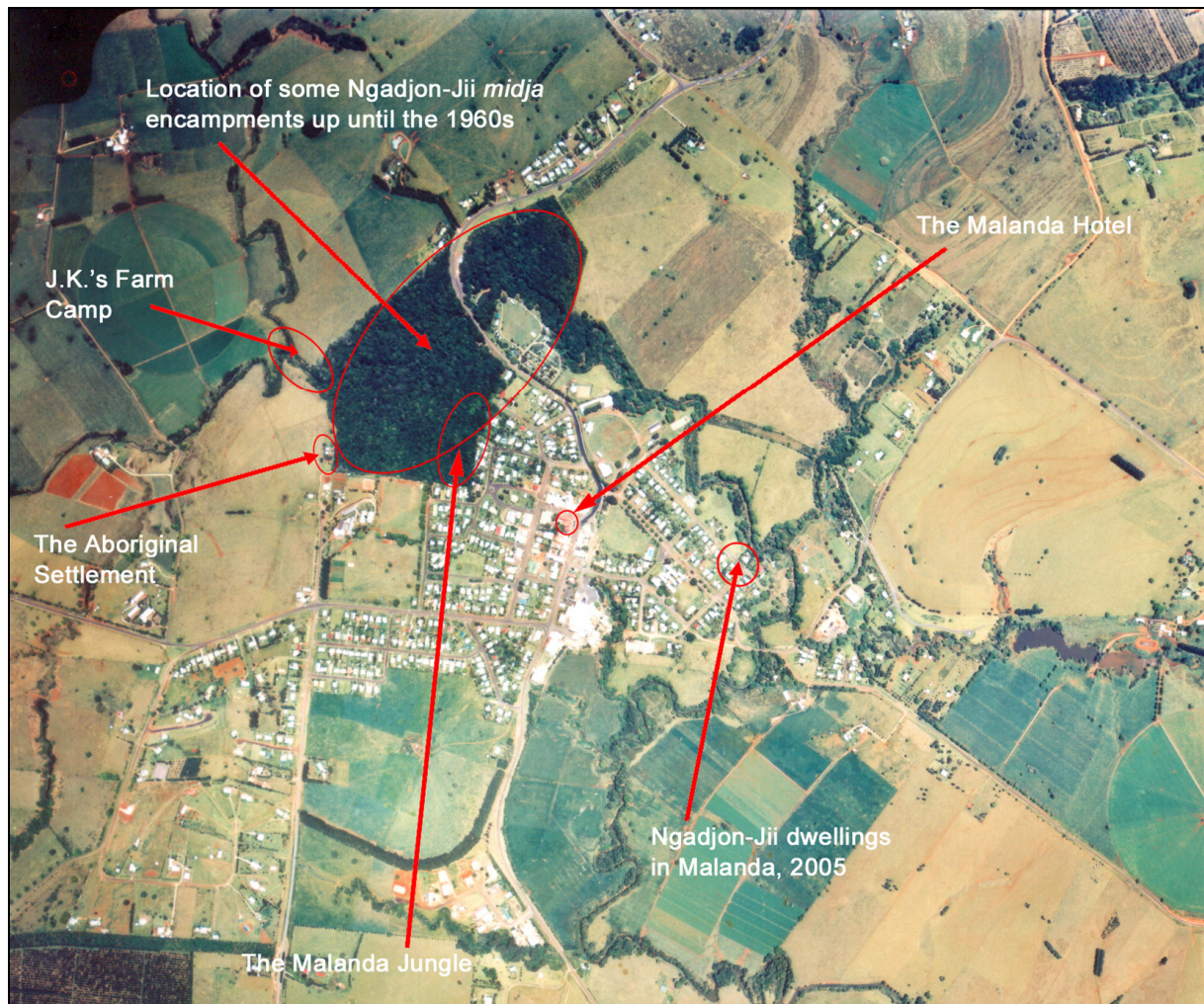
Figure 27: Location of Ngadjon-Jii camps and dwellings, and other places of historical significance in Malanda (Graphics: Birgit Kuehn).

In 1995, Aborigines living in the Eacham Shire appear to be reasonably well integrated into the general stream of present day society. Aborigines no longer live in camps on the edge of town, however, in their hearts they probably still cherish their dreaming” (Eacham Historical Society 1995: 6).