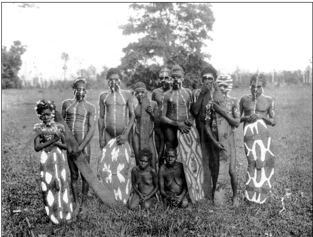
Figure 12: 'A group of Aborigines, Upper Russell River 1895, with implements and body markings'.