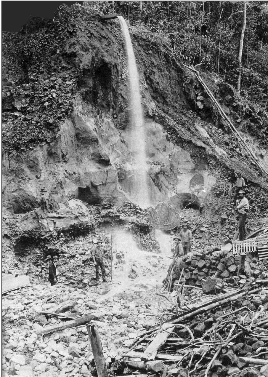
Figure 14: ‘Sluicing gold at the Mayflower Claim on the Russell River using hydraulic sluicing, ca. 1890s’.

for the overall brutality of Aboriginal exploitation. As he states in an 1887 press interview, “Blackfellows ... have generally been shot down by any whites who have come into contact with them” (cited in Savage 1992: 237). As his diaries testify, Palmerston himself is not beyond ‘rifling’ (ibid: 218) the Aborigines he comes into contact with. Behind Palmerston’s actions lies his ‘belief’ “that the country must be cleared and utilised by means of black labour” (ibid: 239). According to Palmerston, Europeans could not be enticed to work for the same kind of pittance provided to Aboriginal workers or “work for a master in the scrubs” (loc. cit.). As Palmerston comments, a ‘white man’ toils so that he can make “a home for himself and his family” and enjoy the future riches and ‘snug comforts’ of such efforts (loc. cit.).