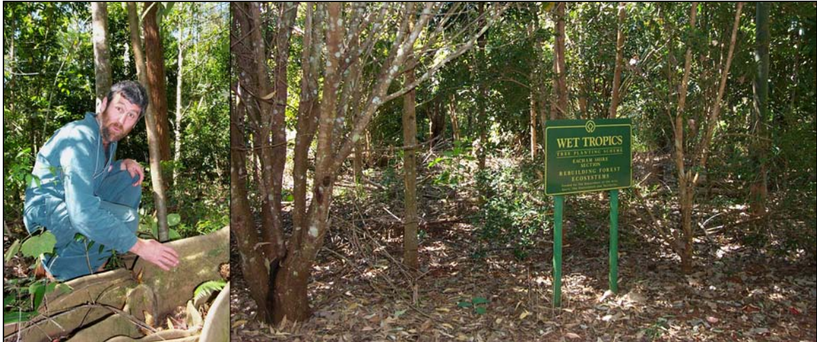
Figure 4.4: Buttressed root of quandong in a sixteen year-old planting ( left ), and ( right ) the Wet Tropics Tree Planting Scheme plantation at Pelican Point after seven years (photographs courtesy of Heather Proctor).