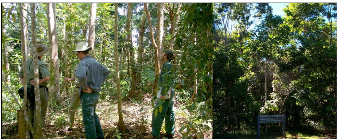
Figure 4.3: Ecological restoration plantings at (left) sixteen years, and (right) 22 years (photographs courtesy of John Kanowski).