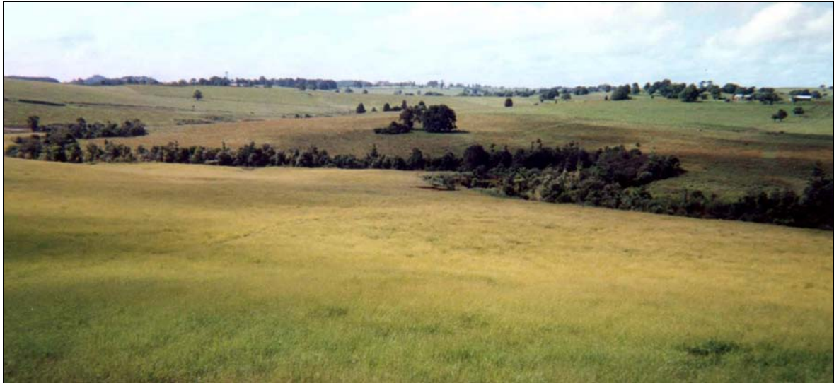
Figure 4.1: Extensively cleared landscape in which riparian (streamside) rainforest has been recently reinstated using dense ecological restoration plantings (Atherton Tablelands).