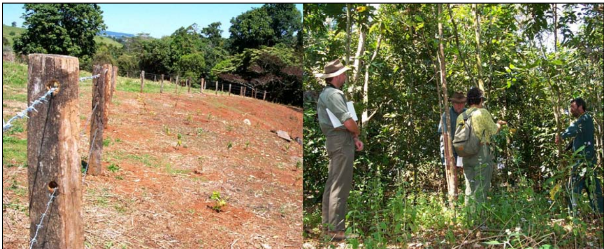
Figure 4.2: Ecological restoration plantings at (left) three weeks, and (right) eight years.