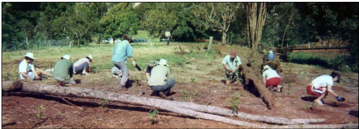
Figure 4.5: Ecological restoration involving community tree-planting by members of TREAT (Trees for the Evelyn and Atherton Tableland).