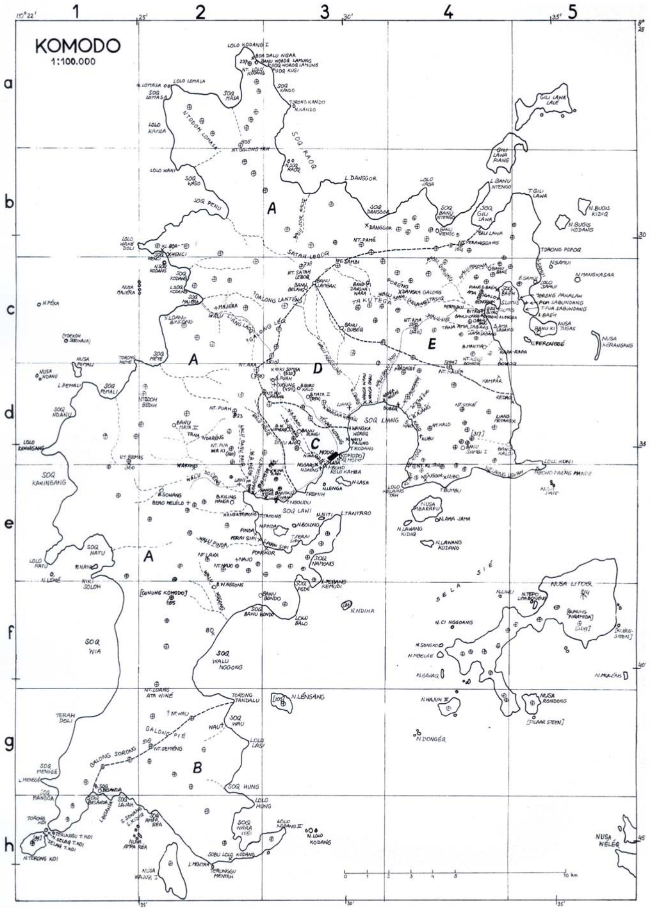
Map 2: No 'Terra Nullius' – Verheijen's map of Komodo Island, illustrative of a dense landscape of named places and sites of significance to local people (Map: Verheijen 1982).