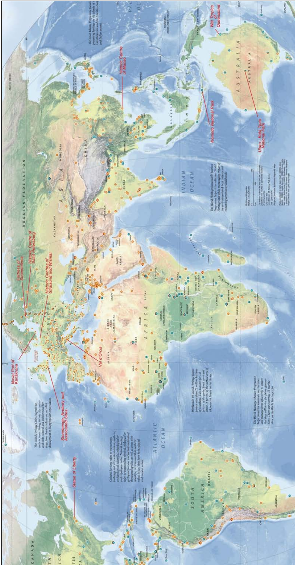
Map 1: Detail from the map “World Heritage 2006”, with locations of World Heritage sites highlighted that are featured in this report (Map: UNESCO World Heritage Centre; Graphics: Birgit Kuehn).