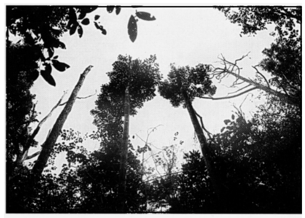
One of the patches of tree dieback at Mt Lewis caused by Phytophthora cinnamomi.

The organism is very hardy and its infective agent can be carried on motor vehicle tyres and footwear. It can also be spread through ground water or by animals, including feral pigs. Once it finds a foot hold, it is nearly impossible to eliminate.