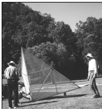
The ground team setting up calibration equipment prior to the AirSAR flight

On August 31, 2000 NASA's Airborne SAR instrument was flown along a ten kilometre wide strip from Port Douglas to Cooktown. At the same time research staff from the University of Queensland and CSIRO Land & Water collected ground survey and vegetation data in rainforests and mangroves to calibrate the image data set. Vegetation structural information included tree height, canopy depth, trunk diameter at breast height (dbh), tree location and as far as possible species. The purpose of the flight was to investigate the relationship between the radar images and rainforest structure and condition. A previous NASA AirSAR mission in 1996 collected images over the same area which, together with field data and the 2000 images, will be used to examine changes in the rainforest over time.