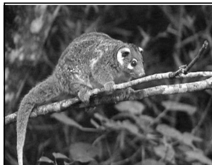
Below: Green ringtail possum ( Pseudocheirops archeri )

Providing science for the conservation and management of Australia's World Heritage tropical rainforests.