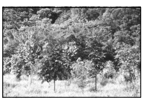
A young mixed species forest including fast growing, high quality timber species

In early 1998, questionnaires were distributed to 500 landholders in Atherton, Eacham and Johnstone