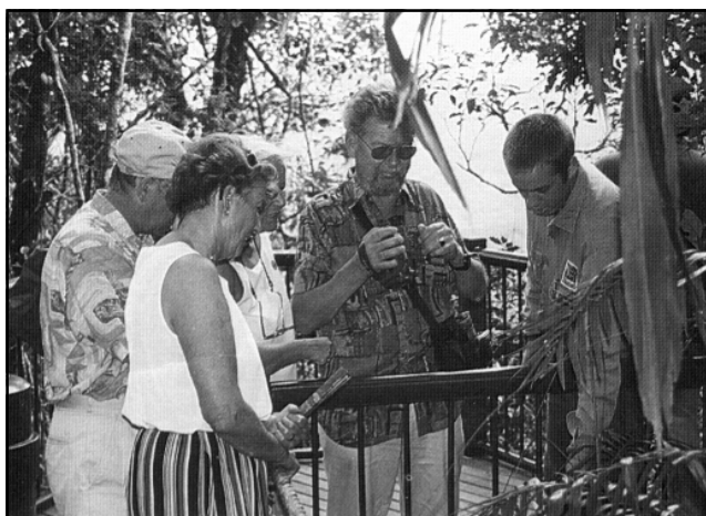
An interpretive ranger (right) at the Skyrail boardwalk takes the time to point out rainforest plants to Skyrail visitors.

Skyrail provides the opportunity for large numbers of tourists of every nationality, interest and ability, to access a valuable and important environment. Not only are these visitors able to access the rainforest, but Skyrail had succeeded in encouraging a sense of inquiry and in helping visitors actually learn something about the environment.