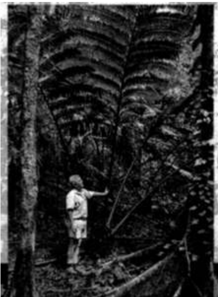
The Daintree's King Fern species is around 300 million years old.