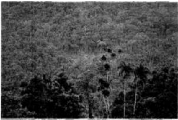
The Daintree's canopy is alive with birds, insects and even mammals.

"We use trucks for transport now. That's been a big change."