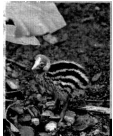
A baby cassowary.