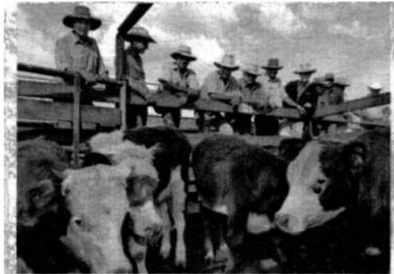
Mobs of Daintree cattle were driven to Mossman and Mareeba.

But Lyn adds that the pluses outweigh the difficulties. "You wouldn't live or work here if you didn't have a love for the rainforest. It's beautiful and wonderful just being surrounded and living among it."